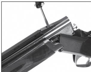
Turn the screw to raise or lower the rear of the rib.