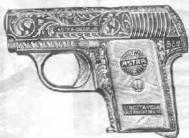
ASTRA Pistol, Mod. 202 With fine engravings in silverplated finish.