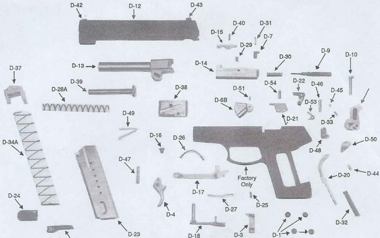
(D.A. DECOCKER MODEL SHOWN)