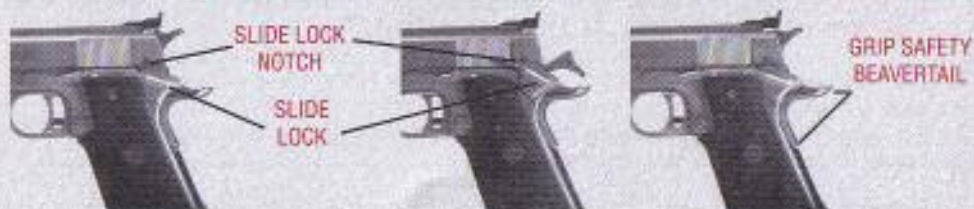
FIGURE 1. SLIDE LOCK NOTCH

The slide lock safety, Figure 1, can only be engaged when the slide is fully forward and the hammer is fully cocked. The slide lock safety prevents rearward motion of the slide and engages the sear to prevent forward hammer movement when the trigger is squeezed. The grip safety, figure 2, is automatically engaged to prevent rearward trigger motion until the pistol grip is firmly and properly grasped.