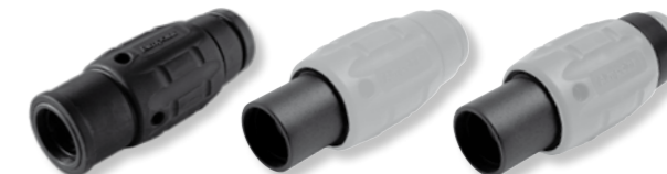
Fig. 1 Aimpoint 3XMag with rubber

In order to use the 30 mm diameter tube(s), the rubber covering that surface must first be removed. Remove rubber from the front tube as shown in fig. 2 below when TwistMount or one ring is used (most common). Remove rubber from both tubes as shown in fig. 3 when both tubes are used. Use a sharp knife and carefully cut through the rubber along the circumferential groove making sure not to cut into the metal body.