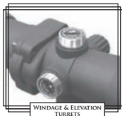
WINDAGE & ELEVATION TURRETS

Turn the turret counter clockwise to make the reticle move to the right. Turn the turret clockwise to make the reticle move to the left.