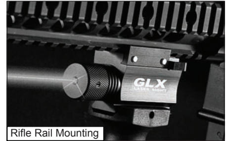
Rifle Rail Mounting