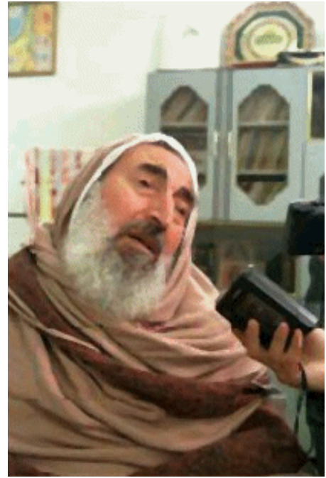
Sheik Ahmed Yassin