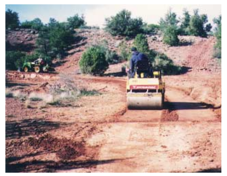
Figure 1. Equipment working on the Bell Rock Pathway on the Coconino NF.

In December 1997 and May 1998, work was done on the Bell Rock Pathway on the Coconino National Forest. (See figure 1).