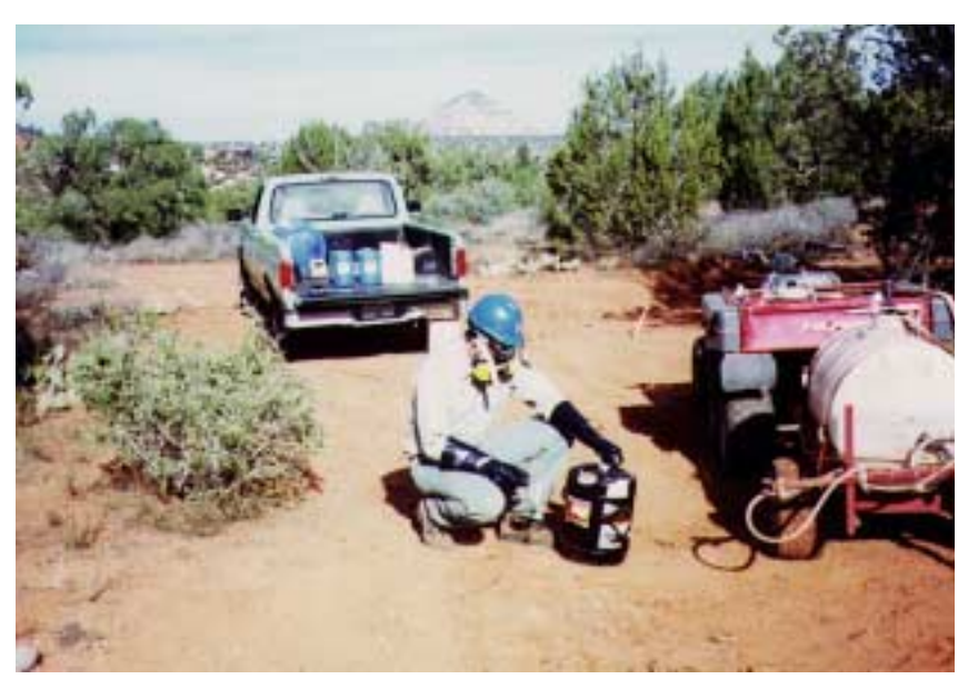
Figure 4. Bentonite with Roadbond EN-1 being applied to trail. Note that the worker is wearing the required PPE.

Roadbond EN-1<sup>®</sup> is a patented liquid road base stabilizer that is mainly a diluted sulfuric acid that is labeled as a corrosive for shipping, storage, and handling. This product requires more personal protective equipment (PPE) than any of the other products used. A properly fitted respirator, goggles or face shield, elbow length rubber gloves, and a protective apron should be worn to protect from the fumes and possible splashing as you measure the product for dilution. (See figure 4). After the product has been further diluted prior to application, it is not considered a risk to work with or a risk to the environment.