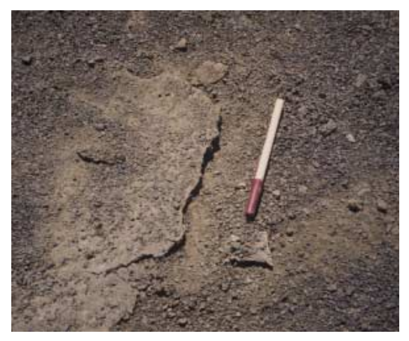
Figure 5. Crack that developed in trail after second winter.

After 5 winters, there has been one small section about 1 square foot (0.1 square meters) in size that has cracked and begun to flake up on one edge. This crack shown in figure 5 developed over the second winter, and no attempt to repair it was done in order to see if the area would get worse over time. It did not develop into a more serious defect, and it is expected that a repair could be done fairly quickly by removing all of the loose surface material, wetting the surface, mixing the proper amount of ROAD OYL into a "fine" aggregate, placing it into the damaged area, and compacting.