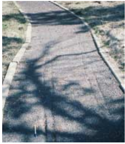
Figure 3. Visible ruts on trail.

shaded areas, but the trail itself was free of snow. This section of trail was saturated with water, and it was apparent from the visible ruts that a wheelchair user had recently been on the trail. (See figure 3). Even though there were no obvious signs that a wheelchair had traveled from the parking area over the trail constructed with Road Oyl<sup>®</sup> (described later in this report), there were 1-inch (25.4millimeters) deep ruts created by the chair wheels beginning at the start of the EMC<sup>2</sup> section and continuing through the entire length of the EMC<sup>2</sup> section. As the trail dried out through the spring and summer, the surface did not harden. Later in the summer, it was possible to easily scrape 2 inches (50.8 millimeters) through the surface with the edge of a boot. When John Parker did his trail evaluation, he found the trail to have a soft surface and it was not easy to push his wheelchair over. He felt that the surface was all right for a short distance, but he would not want to travel far on that type of surface.