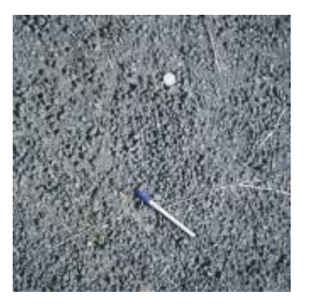
Figure 6. Macadam surface with blotter sand blown away.

the problems of noise and bumpy ride for a wheelchair user would probably be resolved.