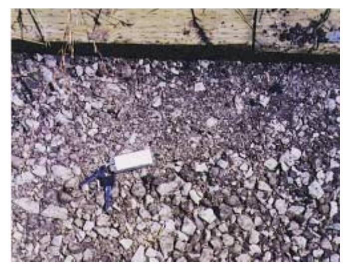
Figure 7. Coarse materials and loose surface rocks make it difficult to turn the wheels on a chair or walker.

To achieve a firm and stable surface it is recommended that one use fine aggregate (3/8-inch minus; 9.53-millimeters minus), rather than coarser aggregate that can cause problems for individuals using mobility aids. If a surface with coarse materials has any raveling, the loose surface rocks can make it very difficult to turn the wheels on a chair or walker. Loose surface rocks can also make placement of canes or crutches very difficult. (See figure 7.) Two types of fine aggregate material that are not suitable for accessible trails are sand and pea-size gravel. Both of these materials create surfaces that are very difficult to move a wheelchair across. Sand does not have any large particles (1/2-inch, 12.7-millimeters) to help keep the wheels from sinking into the soft surface, and pea-size gravel does not have enough interlocking surfaces or any fine material to give the pea-size gravel stability. A well graded mixture from 3/8-inch (9.53-millimeters) down through the very fine material is what is needed.