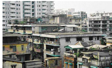
Private and city dwellings