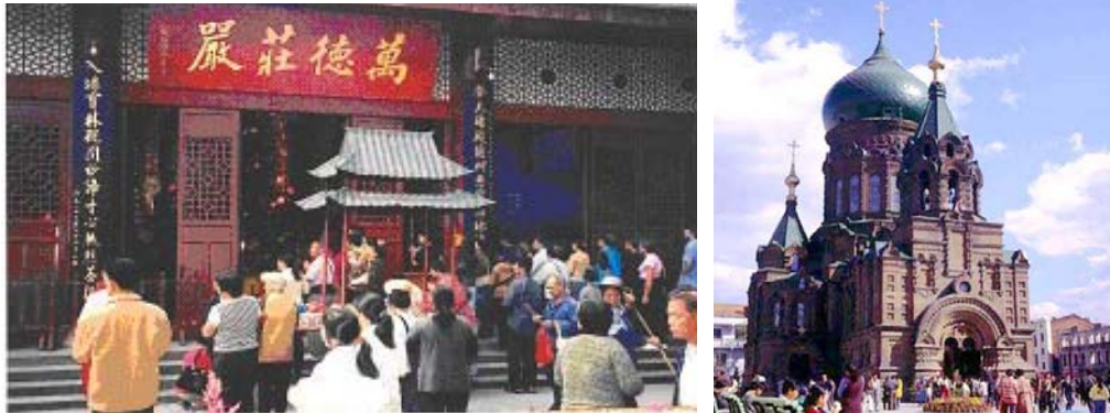
Buddhist temple and Catholic church

Christianity and Islam are monotheistic religions. Adherents believe in the idea of an immortal soul and that a person's actions in this life affect his or her afterlife.