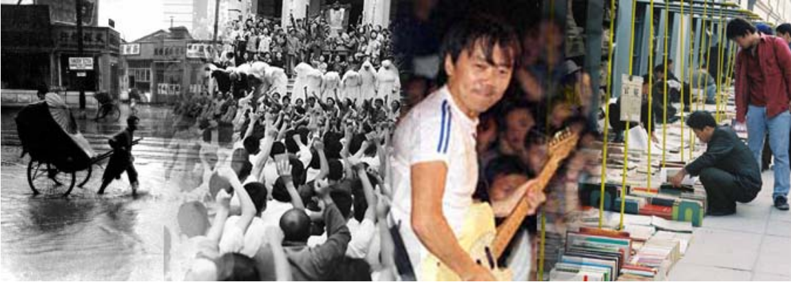
Left to right to: a rickshaw in 1930s Shanghai; a rally against Party enemies in the 1960s; a rock concert in the 1980s; people browsing the wide variety of books now available.

The CCP leader, Chairman Mao, is a controversial figure. Today, the official line is that he was “70 percent right and 30 percent wrong.” During Mao’s rule from 1949 to 1976, his authoritarian policies led to more than 30 million deaths from mass imprisonments in labor camps, starvation from poor economic policies, and violence from public political campaigns.