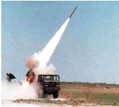
Due to the expense, live fire exercises are rarely conducted.

The PLA has little money for training, especially expensive live-fire and battlefield exercises. It tends to focus on cheaper, but less effective methods, such as simulations and war games. The PLA has several other training issues, including the difficulty of integrating modern technology and the lack of joint capability.