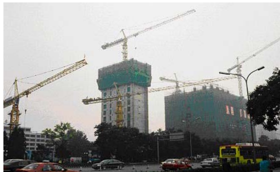
The growth of private industry has led to rapid development in urban areas

Another social problem is “money worship” ( bajinzhuyi ). Many Chinese have completely abandoned socialist ideals in pursuit of acquiring wealth and entering the private economy, known as xia hai (literally “jumping in the sea”). While this has helped the Chinese economy and has raised many families' standard of living, many Chinese feel their society has lost its moral grounding.