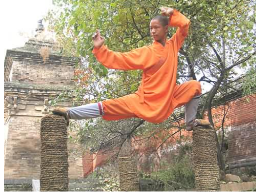
Martial arts practice

In urban areas, there are many ways to spend leisure time. Particularly popular are ballroom dancing, traditional fan dancing, taji quan (called taichi or shadow boxing in the West), qigong exercises, wushu (martial arts), basketball, and ping-pong. Board games, such as Chinese chess, are popular among older Chinese, and young urban Chinese enjoy video games and Internet chatrooms.