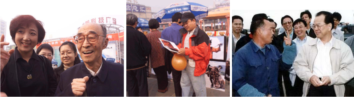
Clothing varies widely.