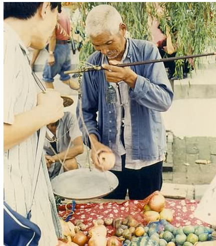
Shopping at a local market

Bargaining is almost considered a sport in China. Except in large stores where prices are listed on each item, bargaining is expected. Especially at roadside stands and outdoor markets, one should assume that the price may be lowered.