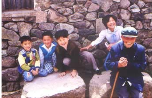
Han Chinese family