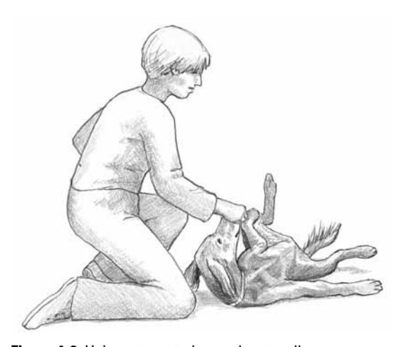
Figure 4-2: Using a treat to lure a dog to roll over.

Click (or say "Yes!") and give your dog a treat whenever she does a full roll, whether you helped your dog or not.