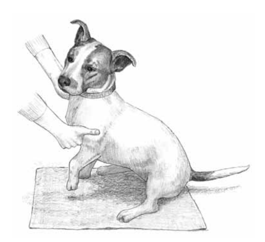
Figure 4-1: Pressing the shoulder to get your dog to lift a paw.