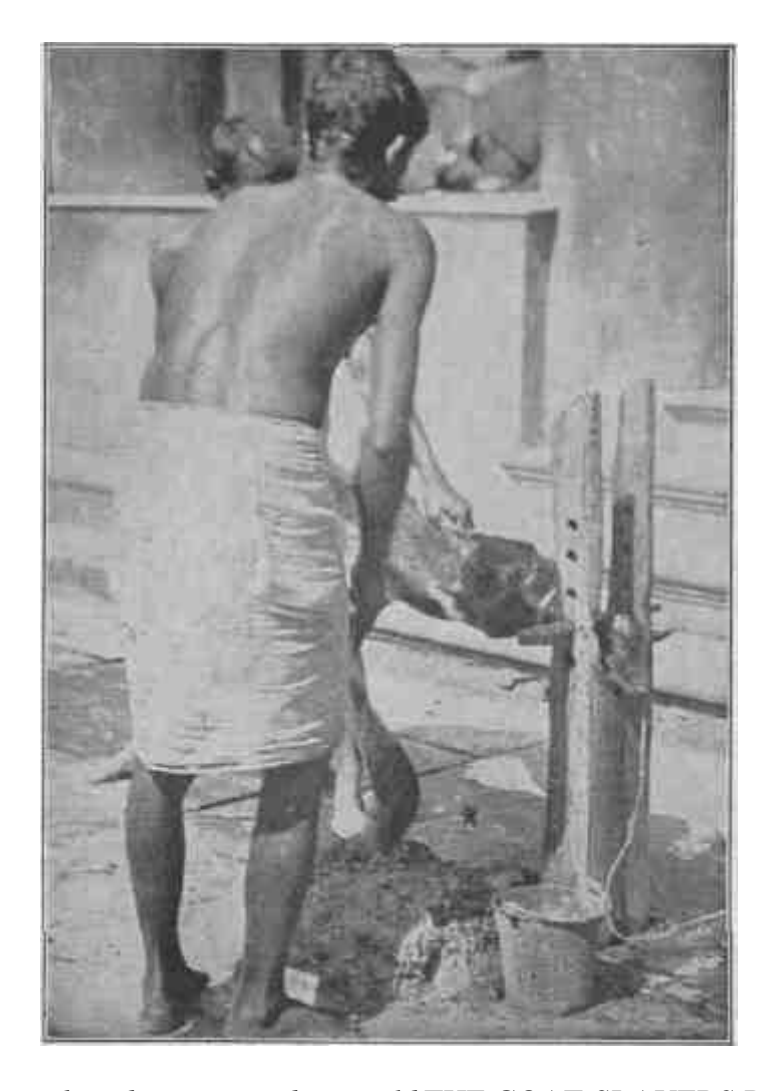
THE GOAT-SLAYERS Priests in Kali-ghat (Sec page 6.)