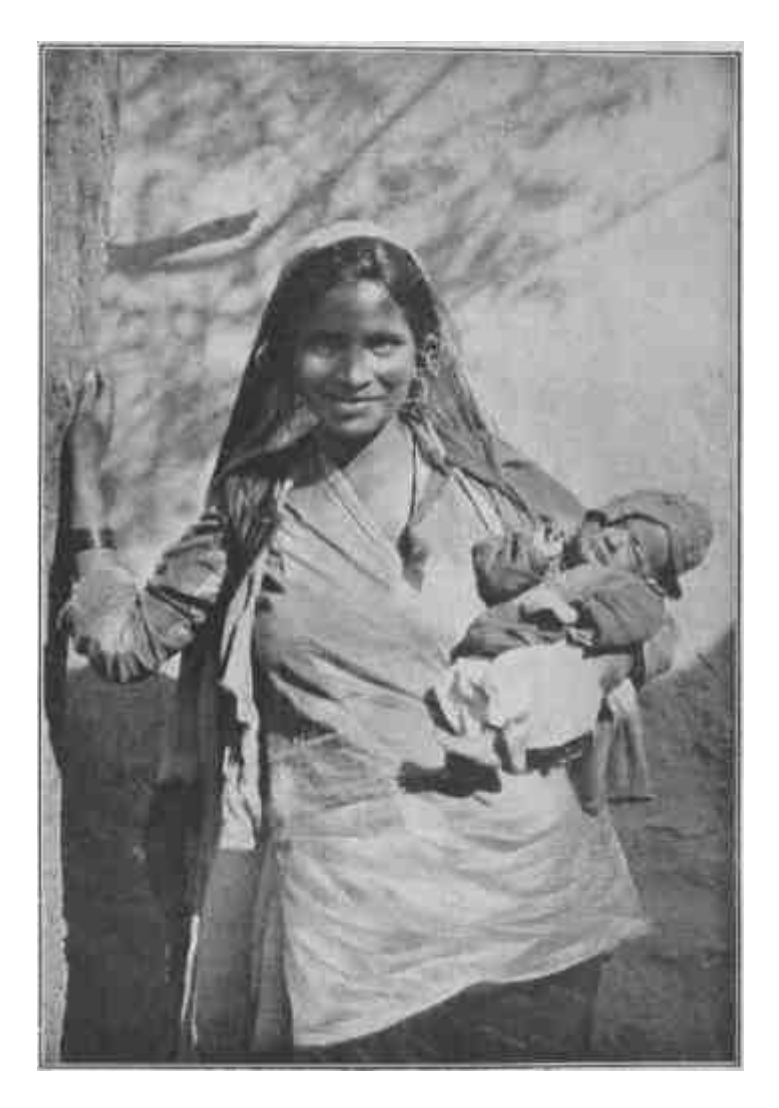
THE UNTOUCHABLE "Just stood in the doorway." (See page 163. )