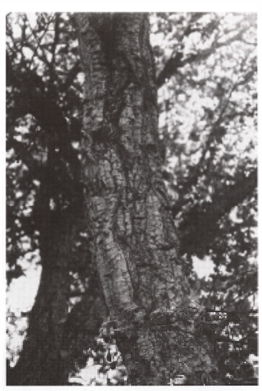
Cork Oak (small branch).

Lichens are actually two organisms (an alga and a fungus) living in a symbiotic relationship with each other. They are generally very slow growing and, therefore, cannot easily replace themselves when picked. In some cases, a substantial number of fallen pieces can be collected from the ground.