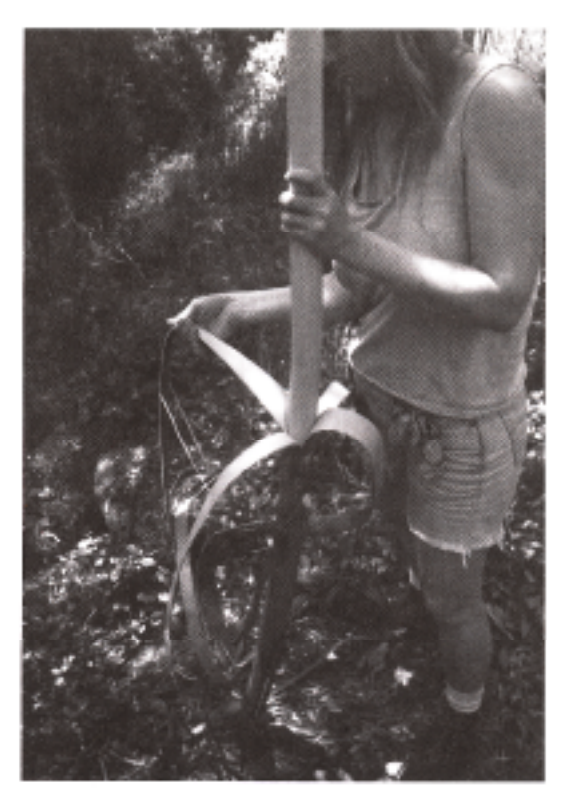
Photo 2: Peeling maple bark from a limb which was removed from a tree felled while clearing for a roadway.

harvesting decisions. The person who is solely a nature observer knows only the name of a plant and maybe where it grows and what eats it. The nature participant, on the other hand, learns these things and more. Can I eat it? What does it taste like? What is the wood like? What effect will my cutting that shrub have on the neighboring area?-and so on. These kinds of intimate bonds run very deep. When we see a hazel bush, we really know it inside and out and have hundreds of tactile and visual memories relating to its character. Seeing a plant that you know so well is like seeing an old friend, like-"Hey! It's salsify, how the hell are ya. It's been what . ..a year? Let's do lunch!"