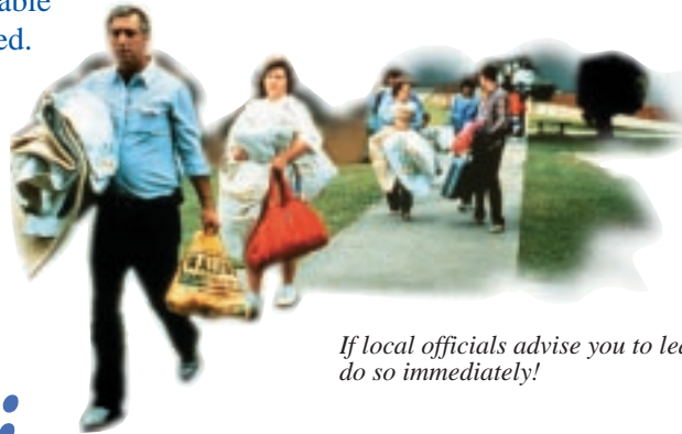
If local officials advise you to leave, do so immediately!

Weather Service personnel use information from Doppler radar, storm spotters, state and local officials, satellites and other sources to issue warnings. These Watches and Warnings are broadcast over local NOAA Weather Radio stations and also are retransmitted by many local radio and television stations. With this information, local emergency management and public safety officials can activate local warning systems to alert communities of an impending weather threat.