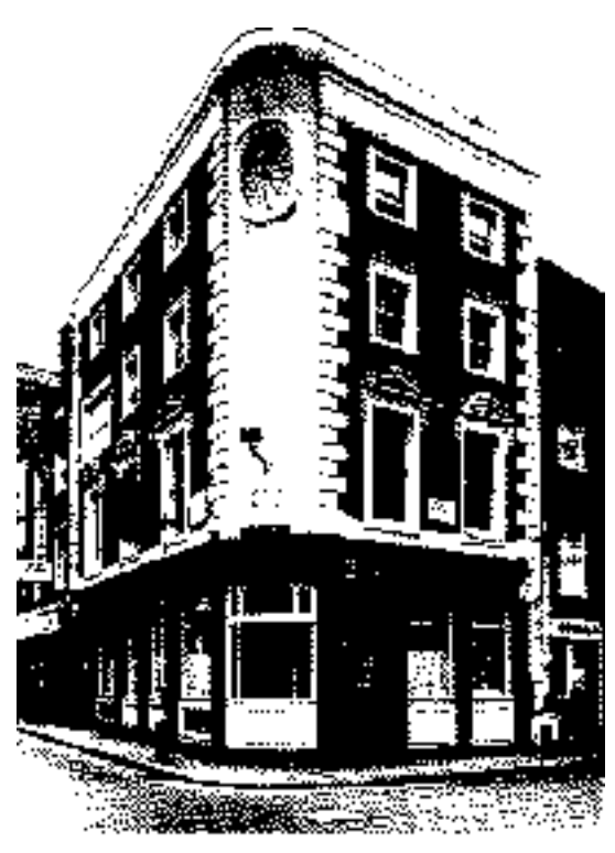
The Red Lion Hotel on Great Windmill St, London. Site of the Second Congress of the Communist League (Nov 29 to Dec 8 1847)