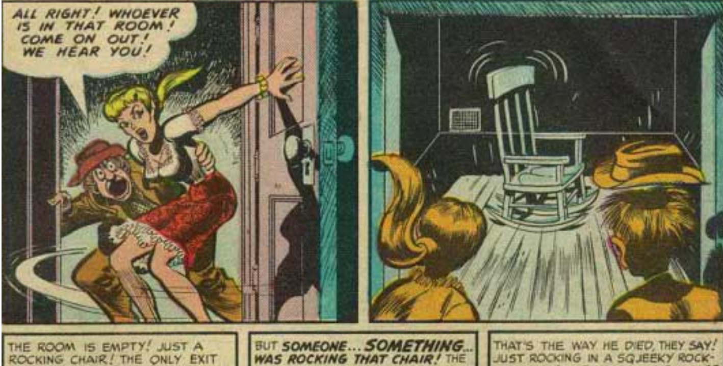
THE ROOM IS EMPTY: JUST A ROCKING CHAIR! THE ONLY EXIT OUT OF HERE IS THIS DOOR AND THAT TINY VENTILATOR, AND NOTHING HUMAN COULD FIT THROUGH THERE!