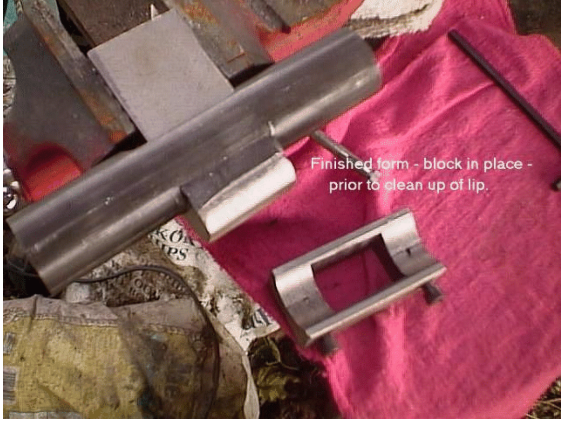
Just about ready to weld on the prepared mag well assembly now. Just need to dress down the lips.