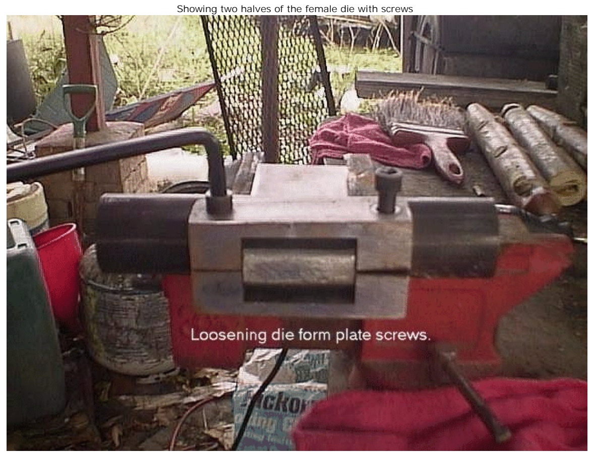
Female die must be formed in two halves in order to release pressure after forming mag well lips