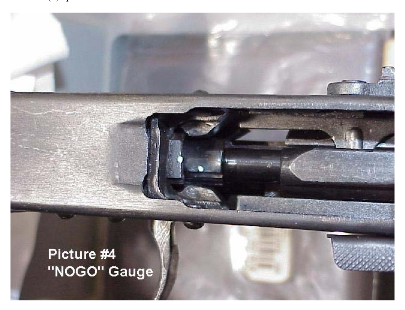
Option 1: Obtain a "Field" headspace gauge to accomplish the same check as stated above to ensure that the reference marks will not align. This gauge indicates the maximum "SAFE" chamber dimension.

"NOGO" Gauge... Pull the bolt carrier back as stated above and insert the "NOGO" gauge. Again slowly move the bolt carrier forward until it stops. The bolt reference marks should not align (Picture #4). At this time the "NOGO" check has been completed. If the reference marks align it means that the chamber is getting close to the maximum allowable size set by the manufacturer. If this is the case you have two (2) options.