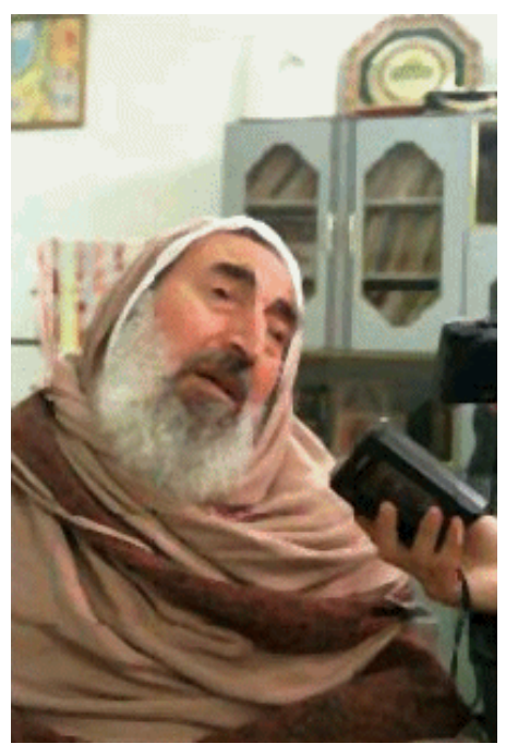
Sheik Ahmed Yassin