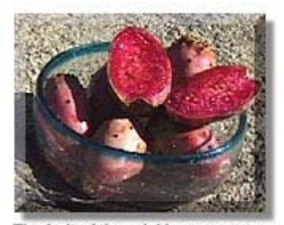
The fruit of the prickly pear cactus.

Prickly pear cactus represent about a dozen species of the Opuntia genus ( Family Cactaceae ) in the North American deserts. All have flat, fleshy pads that look like large leaves. The pads are actually modified branches or stems that serve several functions -- water storage, photosynthesis and flower production. Chollas are also members of the Opuntia genus but have cylindrical, jointed stems rather than flat pads.