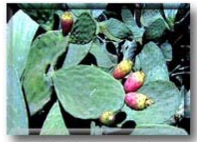
The fruit of the Beavertail Cactus.

Prickly Pear fruit rivals the wild berries of the Northwest in their sheer pervasiveness and abundance. The tender, sweet fleshy buds have a unique and marvelous flavor. The fruits are so delicious that early Spanish explorers sent samples back to Europe where they quickly caught on and remain popular to this day, especially in Italy.