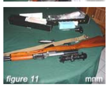
Figure 11 shows the assembled rifle ready to take to the range and sight in!

I do like this rifle project because I did not have to alter the rifle at all. Over all it looks pretty good and the mount seems pretty secure and does not seem to move. The scope for the price is pretty nice and easy to get a good picture no matter the magnification setting.