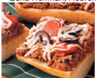
You Will Need 1 pound ground beef