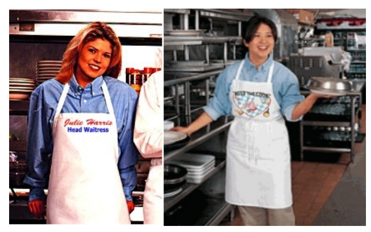
a great gift idea for anyone ... including yourself!

We'll inscribe two lines of YOUR text in a variety of colors YOU choose. You can be like a professional chef with a name and title! Create a personalized cooking apron for yourself or as a great gift idea for anyone that cooks.