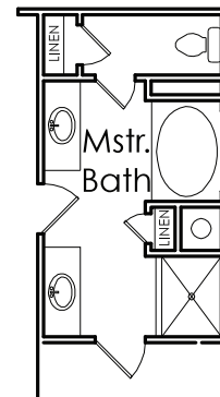
OPTIONAL GARDEN TUB AND SEPERATE SHOWER